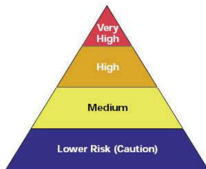
Occupational Risk Pyramid for COVID-19

Worker risk of occupational exposure to SARS-CoV-2, the virus that causes COVID-19, during an outbreak may vary from very high to high, medium, or lower (caution) risk. The level of risk depends in part on the industry type, need for contact within 6 feet of people known to be, or suspected of being, infected with SARS-CoV-2, or requirement for repeated or extended contact with persons known to be, or suspected of being, infected with SARS-CoV-2. To help employers determine appropriate precautions, OSHA has divided job tasks into four risk exposure levels: very high, high, medium, and lower risk. The Occupational Risk Pyramid shows the four exposure risk levels in the shape of a pyramid to represent probable distribution of risk. Most American workers will likely fall in the lower exposure risk (caution) or medium exposure risk levels.